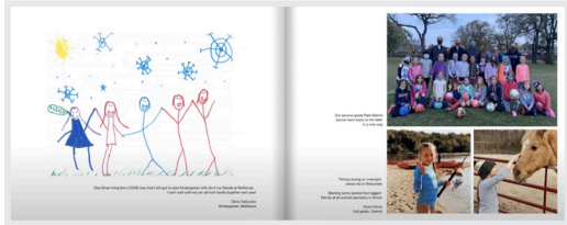
Pages from the The Silver Lining Book

Silver Lining Project books are available to view at all six D39 schools, the Mikaelian Education Center, and the Wilmette Historical Society.